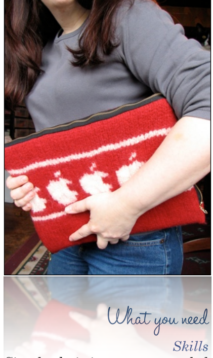
Circular knitting, some stranded knitting